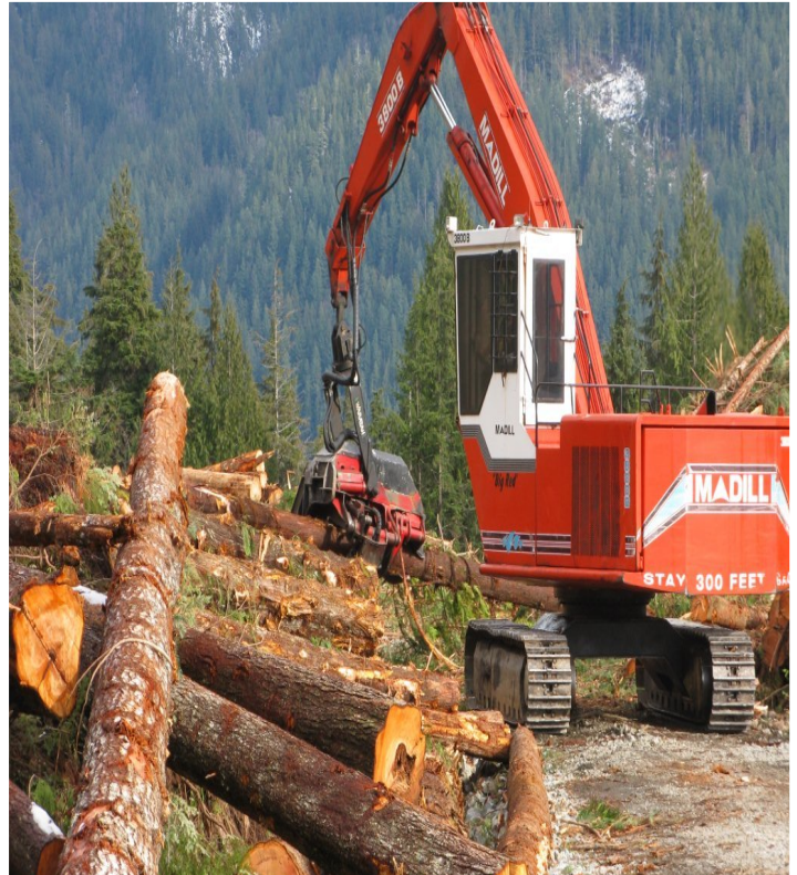
Homalco Forestry LP processor