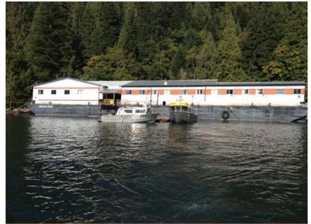
HFLP camp and crew boats

We expect that all these agreements with government and TimberWest will be completed in the next few months.