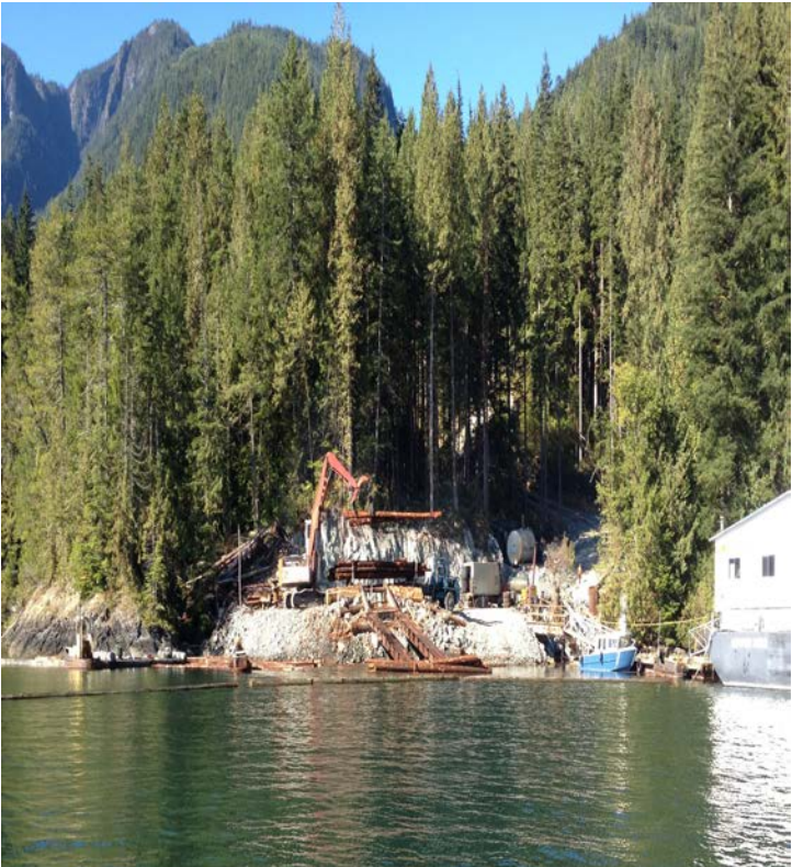
Log Dump at Colliery Creek, Toba Inlet